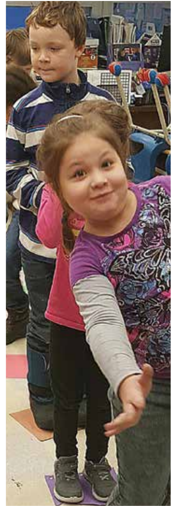
Students “walk on water”

The students enjoyed trying these team-building activities over and over so they could improve their times.